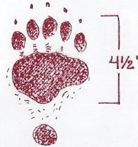
Front Paw Track